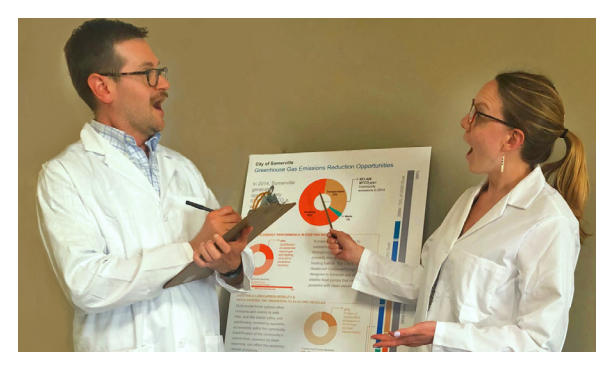
Consumption Data Lab scientists are ready to crunch your data!