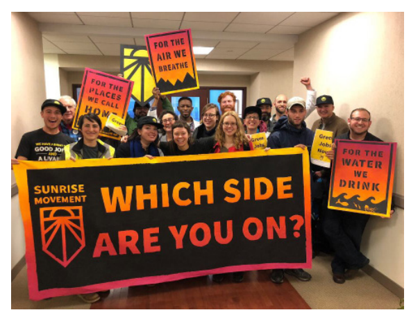
Sunrise Movement will present at ArtBeat this year