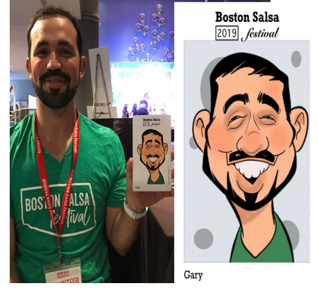
Top to bottom: Somerville Garden Club's "Take a Chance on Seeds" activity;Mystic River Flora & Fauna Chalk Challenge, Caricatures by Alejandro