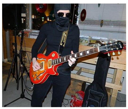
Top to bottom: Lady Saucy, New Aura, Grace Givertz, & the Mystery