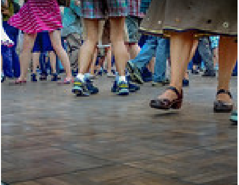
Top to bottom: [Blend], "redirect and progress," and "Street Dances."