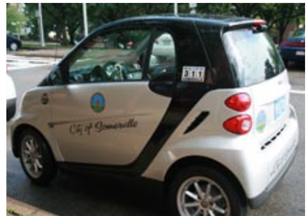
from top: Illustration by Jef Czekaj, Bill Turville's Fish Bike, one of the city's new Smart Cars.