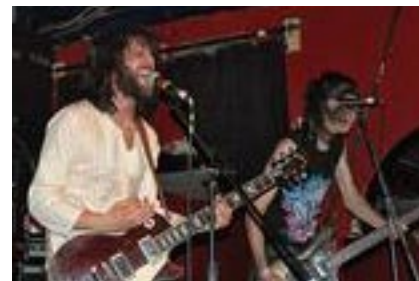
from top: Flooky & the Beans, La Tuza, Sneaks, Los Nitidos, Roll Over Baby, Township